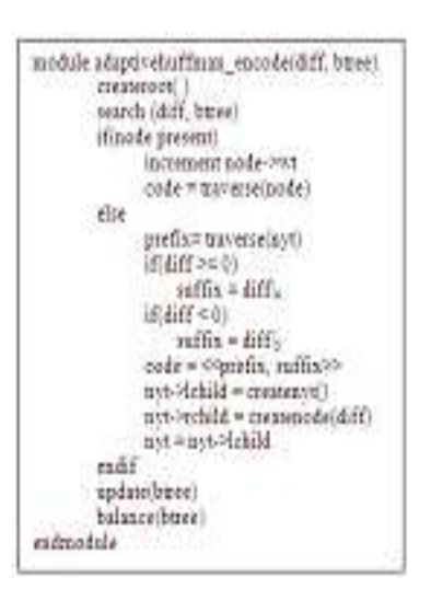
Fig. 1: Pseudo code of adaptive Huffman encoding Algorithm

In the adaptive Huffman coding procedure, neither transmitter nor receiver knows anything about the statistics of the source sequence at the start of transmission. The tree at both the transmitter and the receiver consists of a single node that corresponds to all symbols not yet transmitted (NYT) and has a weight of zero. As transmission progresses, nodes corresponding to symbols transmitted will be added to the tree, and the tree is reconfigured using an update procedure. Before the beginning of transmission, a fixed code for each symbol is agreed upon between transmitter and receiver. When a symbol is encountered for the first time, the code for the NYT node is transmitted, followed by the fixed code for the symbol. A node for the symbol is then created, and the symbol is taken out of the NYT list. Both transmitter and receiver start with the same tree structure. The updating procedure used by both transmitter and receiver is identical. Therefore, the encoding and decoding processes remain synchronized.